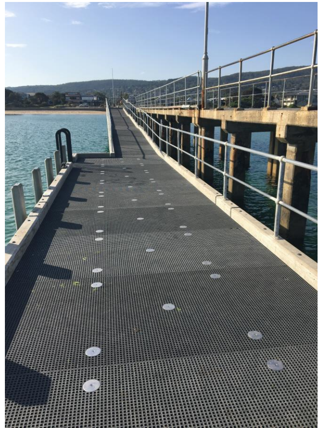
Dromana Pier - low landing looking back to foreshore

To view the design options and Consultation Summary Report visit engage.vic.gov.au or call Parks Victoria on 13 1963 .